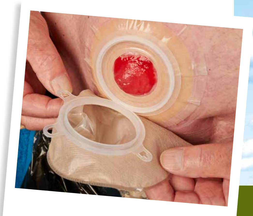
6. Now attach the bag to the base plate.

5. Now position the base plate exactly over your stoma. Check to ensure that it is correctly positioned and has fully adhered to the skin.